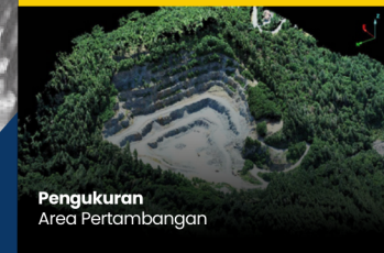
Pengukuran Area Pertambangan

Agisoft Metashape merupakan perangkat lunak yang dirancang untuk pemrosesan fotogrametri digital dan menghasilkan data 3D model untuk digunakan dalam aplikasi GIS , dokumentasi warisan budaya , dan inspeksi power line serta untuk pemantauan hutan.