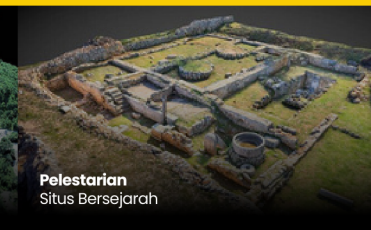
Pelestarian Situs Bersejarah