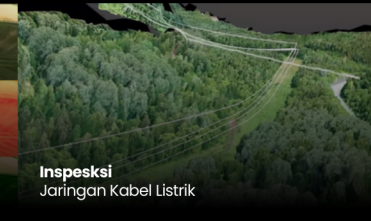
Inspeksi Jaringan Kabel Listrik